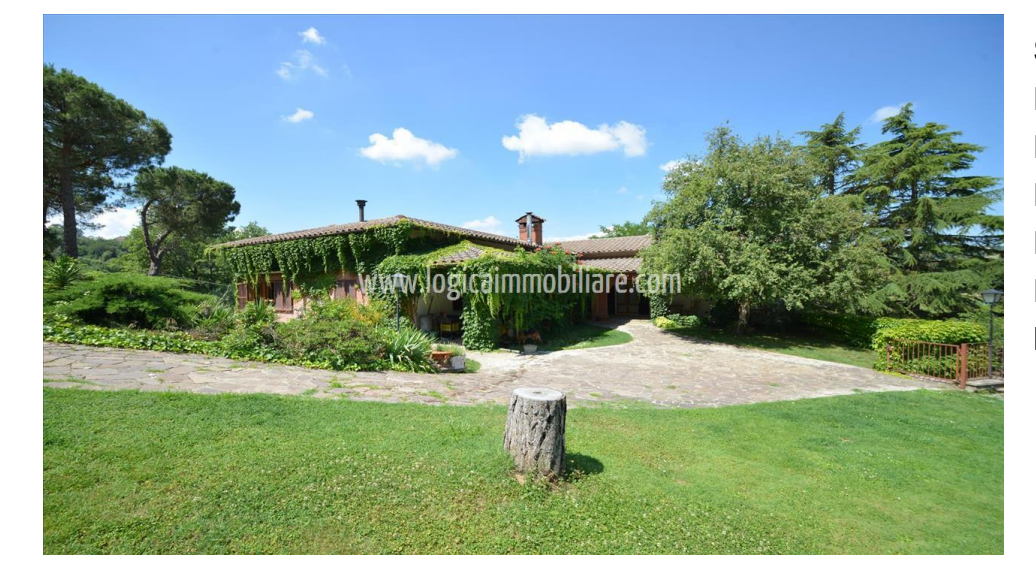
Size: 1592 sqm Field: 13 ha Rooms: 31,5 Bedrooms: 9 Bathrooms: 9 Energy class: G IPE: 175